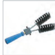
T314 Cable Cleaning Brush