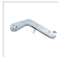
T320 Flint Ignitor