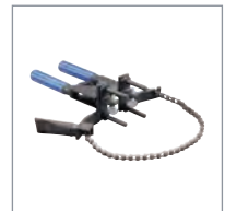
B160V Chain Support Clamp