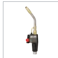
T111 Surefire™ Torch Head