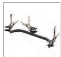
B265 Cable Clamp