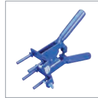
L160 Handle Clamps

Cadweld Accessories can be of U.S. or non-U.S. origin.