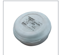
T403 Mold Sealer