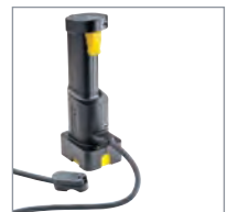
PLUSCU2L6 nVent ERICO Cadweld Plus Impulse Exothermic Welding Control Unit