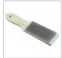
T313 Card Cleaning Brush