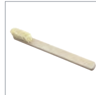
T394 Mold Cleaning Brush