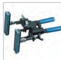
B396 Magnetic Handle Clamp